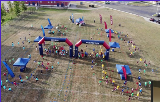
Kick Off Assembly